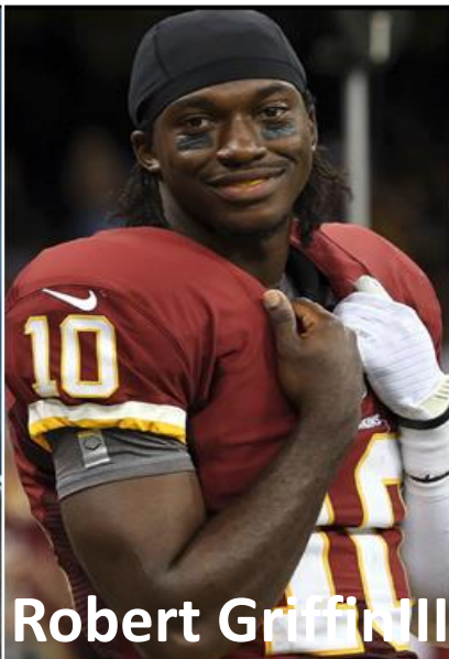
Robert Griffin III