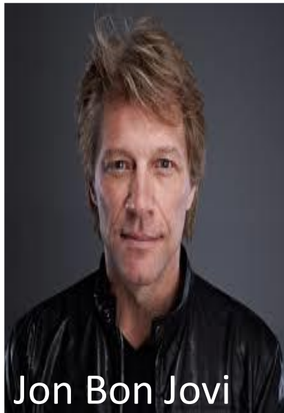
Jon Bon Jovi